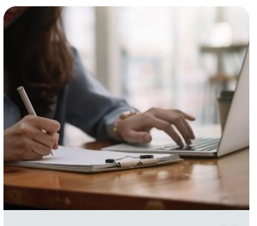
Travel Safety Support