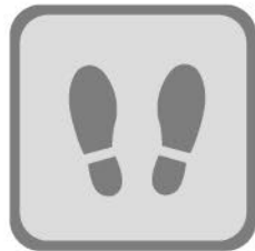
Disinfection of footwear in the footbath.