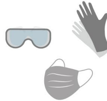
Mask, gloves and protective glasses .

We make sure that all our collaborators enter the hotel without any element that has had contact with the outside. In addition to this, our key positions are living in the hotel to avoid having contact with the outside and avoid any type of contagion.