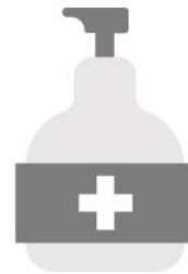
Body disinfection with alcohol spray.